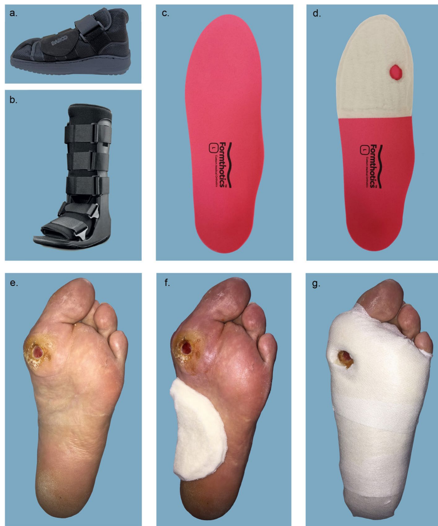
Fig. 1 Conditions assessed in the study: a Postoperative footwear with the lining removed (the control), b RCW alone, c and d RCW with 20 mm of felt padding adhered to an orthosis (RCW with felt to orthosis), e–g RCW with 20 mm of felt padding adhered to the foot (RCW with felt to foot)

reliable [26–29]. The pedar-X ® insoles are 2 mm thick, constructed with 99 capacitive sensors arranged in a grid formation and record peak plantar pressures in kilopascal (kPa) units. The pedar-X ® insoles were calibrated using the trublu ® calibration system as per manufacturer guidelines (Novel, Munich, Germany). The sampling frequency of the system was 50 Hertz. All plantar pressure measures were obtained in accordance with manufacturer guidelines (Novel, Munich, Germany).