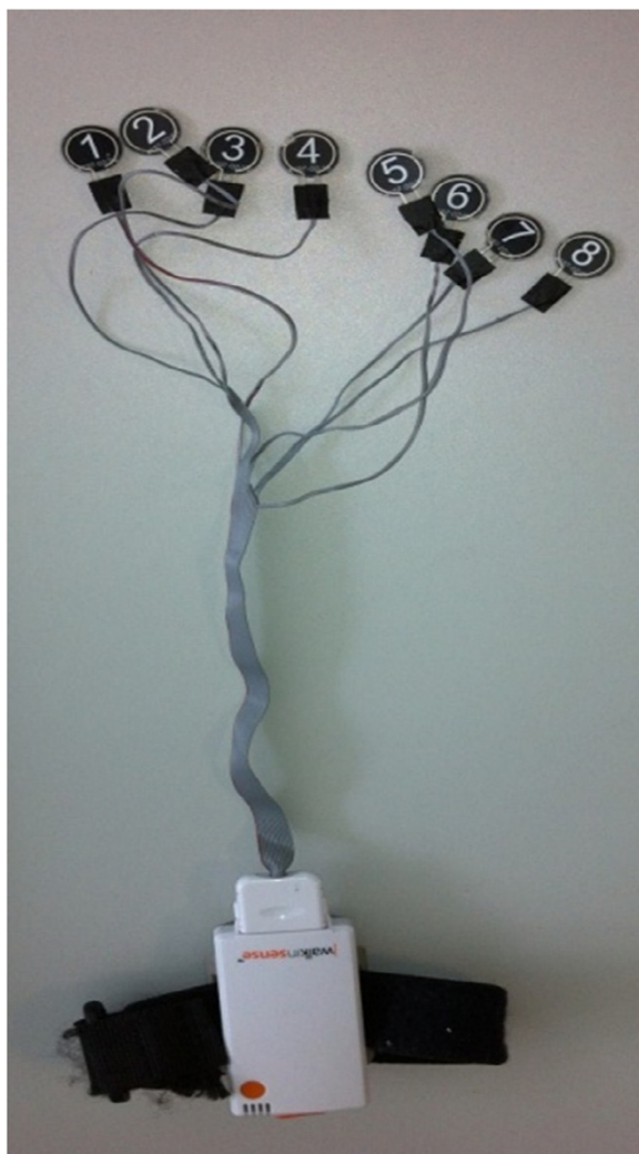
Figure 2 Walkinsense equipment. Sensors are 1 cm 2 and <1 mm thick.