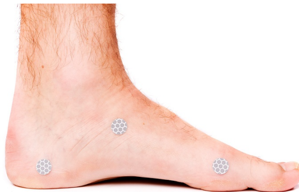
Figure 1 Reflective marker positions used to calculate navicular drop (ND).

The foot length was measured with a ruler from the most posterior aspect of calcaneus to the tip of the longest toe. The foot length ranged from 21 – 31 cm (table 1). Custom made flat markers with a diameter of 13.5 mm made from reflective 3 M scotch tape were used. The markers were placed while participants were seated with the subtalar joint in a neutral position. Neutral position of the subtalar joint was defined as the position where talus could be palpated equally on the medial and lateral side of the foot [18]. An experienced clinician placed the markers with adhesive tape on (i) the navicular tuberosity, (ii) medial aspect of calcaneus 2 cm above the floor and 4 cm from the most posterior aspect of the calcaneus, and (iii) medial aspect of first metatarsal head 2 cm above the floor (figure 1).