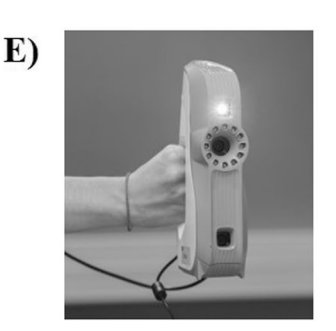
Fig. 1 Devices and setups for the Manual Foot Measurements (A/B), 2D Foot Scan (C) and 3D Foot Scan (D/E). A standardized foot measuring device (WMS<sup>®</sup> foot measurement system, DSI, Offenbach, Germany). B setup for manual foot ball breadth measurement. C 2D desk scanner (iScan 2D, IETEC Biomechanical Solutions, Germany)). D 3D foot scan measurement setup. E 3D hand-held light scanner (Artec Eva; Artec Group, Luxembourg)