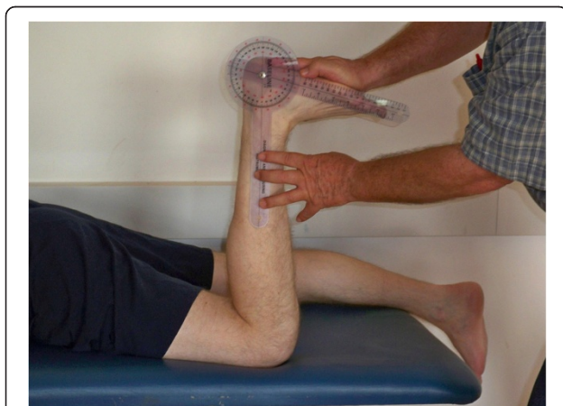
Figure 3 Non-weight-bearing ankle dorsiflexion measurement.

Overall, 5 participants were diagnosed with AT during ABT. All injuries occurred in the right leg. Ankle DF as measured in NWB was more limited among participants that developed AT ( p = 0.025 ). Univariate logistic regression also indicated that NWB ankle DF ROM significantly predicted AT ( p = 0.007 ). The unit odds ratio (OR) for NWB DF in predicting AT was 0.77 (95% CI 0.59 – 0.94) which indicates, that for every 1-degree of increased NWB DF ROM, the odds of developing a future AT reduced by 0.23. The ROC curve for NWB DF