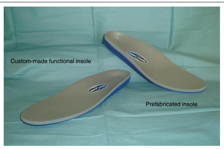
Figure 1 Example of the insoles used within the trial.

For the prefabricated insole group the biomechanical examination, casting and insole prescription writing process was undertaken using the same technique as for the custom-made functional group, but were not used.