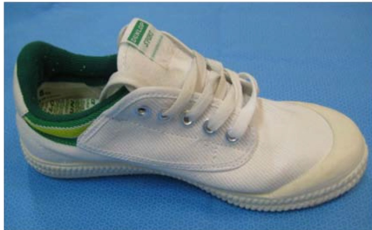
Figure 1 Canvas Dunlop Volley™ (control) shoe.

were considered to have minimal influence on plantar pressures across participants [12]. The participants' own standard footwear (Figure 2) consisted of the shoes the participant wore most regularly and ranged from standard, extra-depth flat lace-up shoes to customised bespoke footwear. The purpose of this footwear condition was to establish pressure offloading properties of standard footwear to enable a direct comparison to the DH Pressure Relief Shoe™. If the participant wore insoles or orthoses that were additional to any insoles that came with the shoe, these were removed prior to measurement.