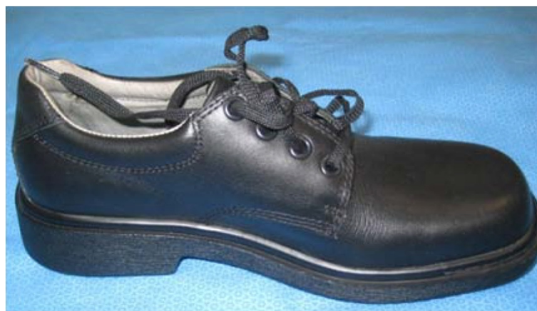
Figure 2 Example of a participant's standard shoe.

To minimise potential ordering effects, the three footwear conditions were tested using a random order sequence,