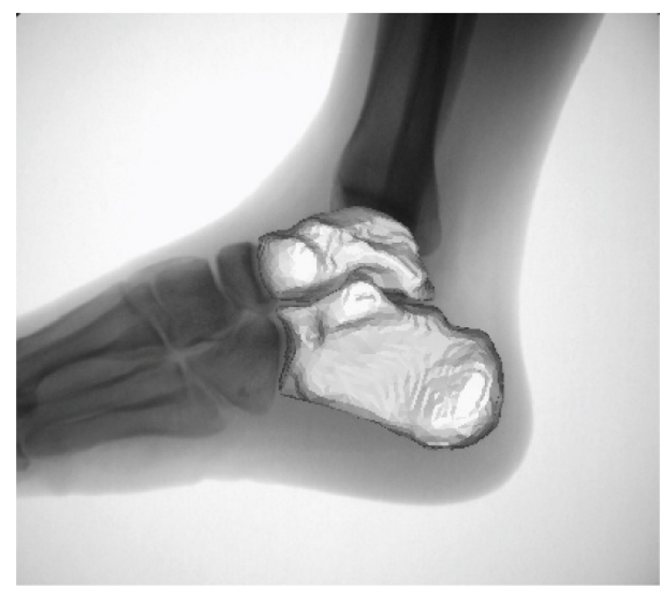
Figure I Shape matching of the talus and calcaneus.

During the nonweightbearing activity from 20° of dorsiflexion to 15° of plantarflexion of the ankle, the subtalar joint everted by 4° and dorsiflexed by 2°. The talocrural joint inverted by 3°, plantarflexed by 32°, and adducted