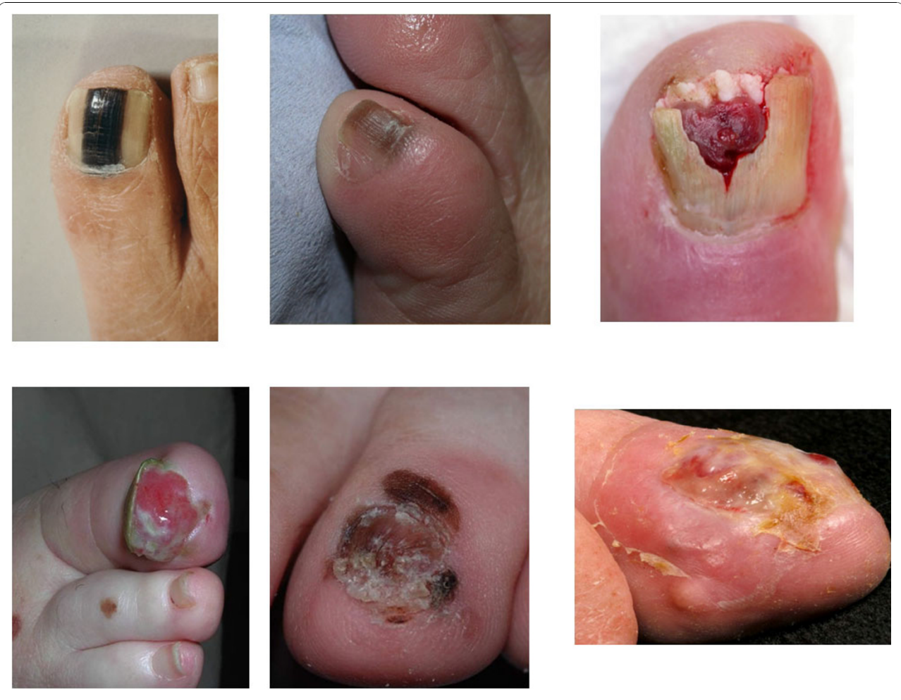
Figure 3 Various presentations of nail unit melanoma.