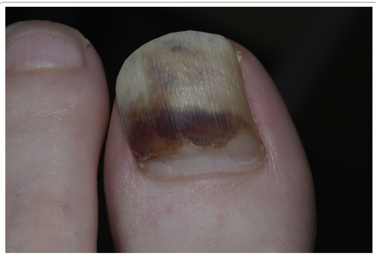
Figure 4 Subungual haematoma. Demonstration of haematoma by clear nail growth proximally.

diseases such as lichen planus which may be manifest elsewhere on the skin. Both squamous cell carcinoma and melanoma would be considered during assessment. In rare instances, the pigment is exogenous, such as that produced by potassium permanganate. This can be demonstrated by scraping the surface of the nail. Where there is onycholysis, the same may apply to the undersurface of the nail. This is particularly the case where there is colonisation by pseudomonas which can lend a green to black appearance.