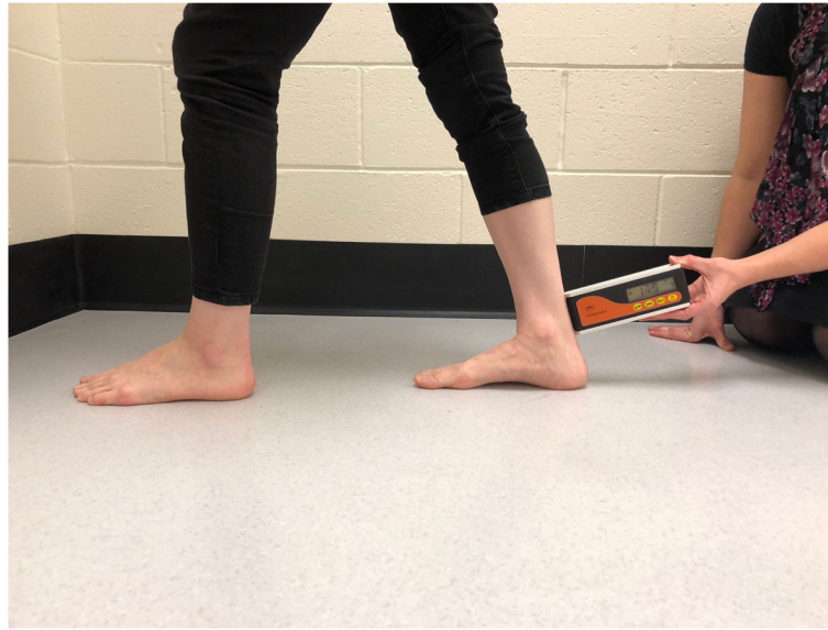
Fig. 1 Weightbearing lunge test – knee extended position

centimetre superior to the posterior calcaneal tuberosity and held perpendicular to the shank of the tibia until the measure (in degrees) remained fixed (Figs. 1 and 2). The degree was determined by the long axis of the device relative to the horizontal (zero degrees). This is consistent with the method of measurement and position of measuring devices in similar studies [13, 17].