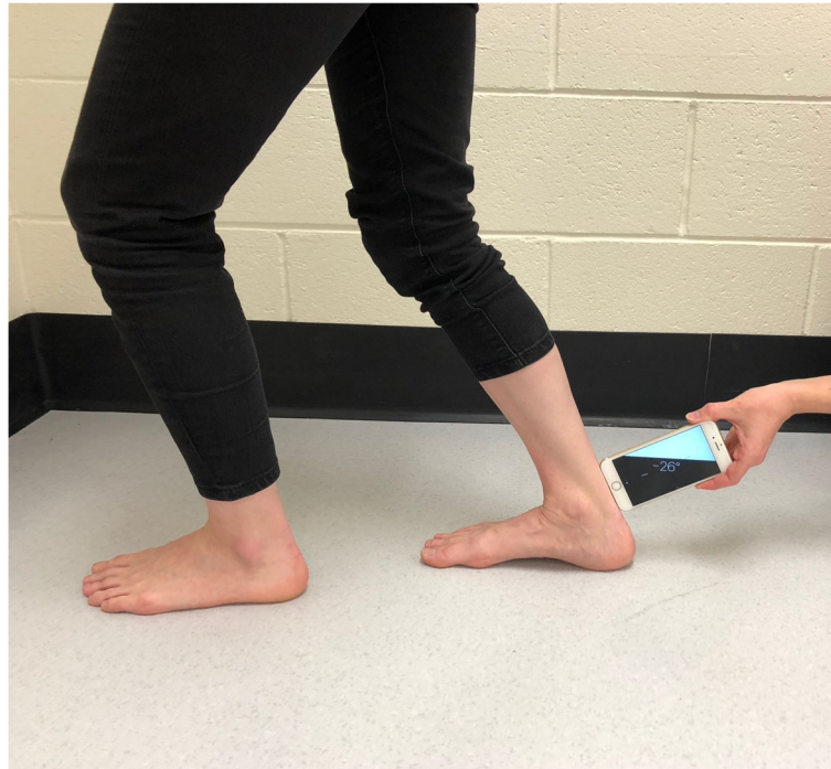
Fig. 2 Weightbearing lunge test – knee flexed position

There were no differences between measures at each time point ( p > 0.05 ). The intra-rater reliability for the tools were calculated for both raters (Table 2). The intra-rater reliability of the digital inclinometer was excellent for both leg positions (ICC = 0.91 to 0.97). The level function had good to excellent intra-rater reliability (ICC = 0.85 to 0.95), the lesser was with the knee extended (Table 2). There was also good to excellent inter-rater reliability between the raters with each tool. The digital inclinometer inter-rater reliability was good to excellent (ICC = 0.85 to 0.96). The level function had excellent inter-rater reliability between raters (ICC = 0.94 to 0.98). The lesser of both ICC scores was in relationship to the knee being in the extended position (Table 3).