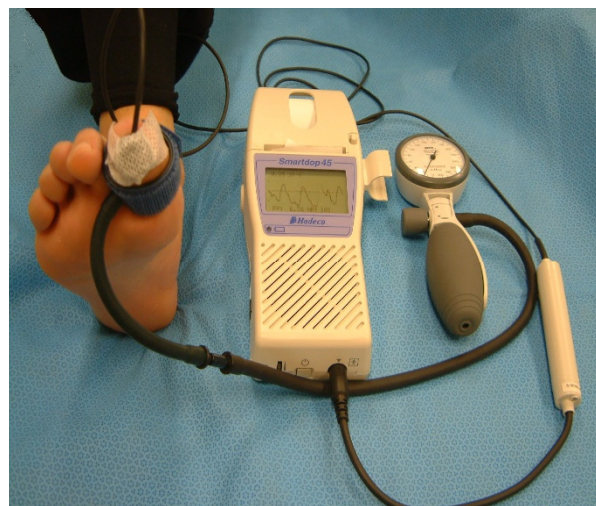
Figure 1 Measurement of Toe Systolic Pressure using a manual PPG unit (Hadeco Smartdop 45)™.

The TBI was calculated as the ratio of the toe systolic pressure to the value of the arm brachial systolic